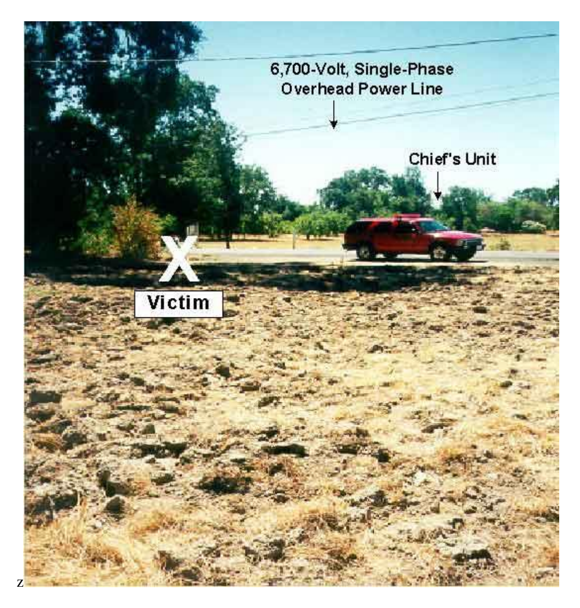
Figure 1. Photo of Incident Site